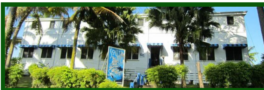
South Seas Private Hostel

Walk or taxi from the bus stand to South Sea's. Taxi will cost around $3-5